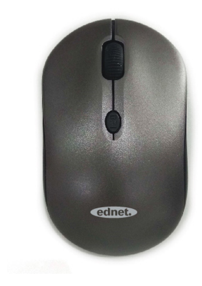
Quick Installation Guide 81166

The wireless notebook mouse is reliable and particularly designed for use with notebook. The optical mouse with 2.4 GHz nano USB receiver offers, with its range of up to 10 m, maximum flexibility. The ergonomic design offers best comfort and makes the mouse suitable for both left and right handers. The ednet wireless mouse allows, thanks to its features and functions, accurate control of notebook or PC. The fast scroll wheel is perfectly suitable for fast navigation. With its adjustable sensitivity settings (800, 1200, 1600 DPI), the mouse can be adjusted to your individual needs. The energy saving mode helps to conserve battery power.