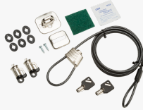
HP Business PC Security Lock v3 Kit

Help prevent chassis tampering and secure your PC and display in workspaces and public areas with the affordable HP Business PC Security Lock v3 Kit.