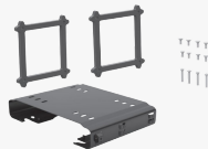
HP Desktop Mini v4+ VESA Sleeve

Wrap your HP Desktop Mini PC in the HP Desktop Mini v4+ VESA Sleeve to securely mount it—with or without an Expansion Module 1,2 —behind your display, position the solution on a wall, and lock it down with the integrated security bracket and optional HP Ultra-Slim Cable Lock.