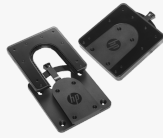
HP Quick Release Bracket 2

Use the HP Quick Release Bracket 2 to attach your HP Desktop Mini to an HP display 1 and a variety of stands, arms or wall mounts. 2 The failsafe "Sure-Lock" mechanism snaps the PC securely in place, and can be further secured with a theft-deterrent security screw.