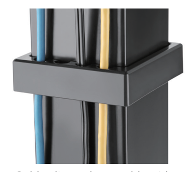
Cable clips to keep cables tidy