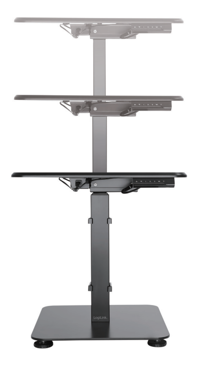
Electric height adjustable desk