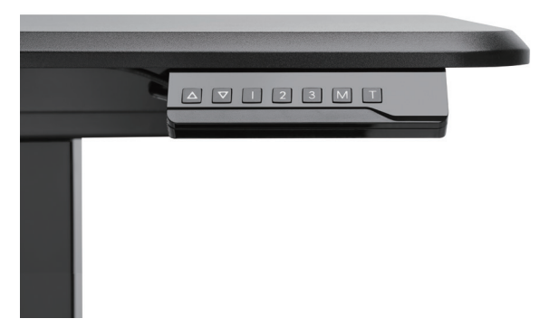
Digital programmable LED memory panel