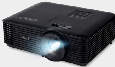
4,500 Lumens SVGA Projector X1128HK