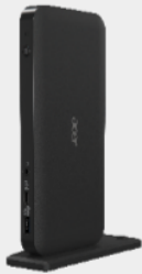
Acer USB Type-C Dock III