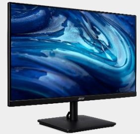
24" ZeroFrame FHD Monitor VA2 series